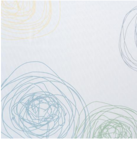
NAHIA TURQUOISE 53