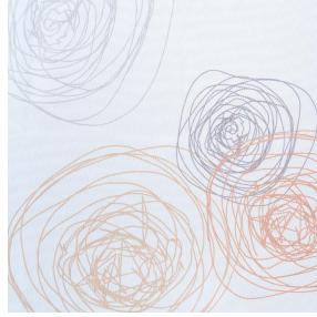
NAHIA CURRY 184 Print pattern