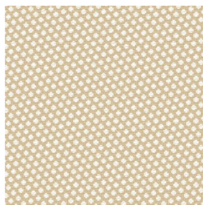
GONIDIE Crème 32