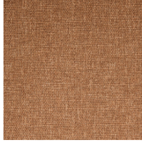
MUNA Sienne 29 Print pattern