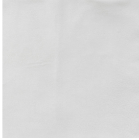
VELTEN BPI 00 Printing support