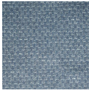
RUSTIC Bleu 41