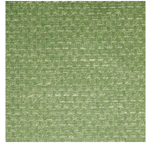
RUSTIC Mousse 92