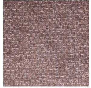
RUSTIC Terre 107