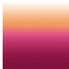
ZADIG Pivoine 57