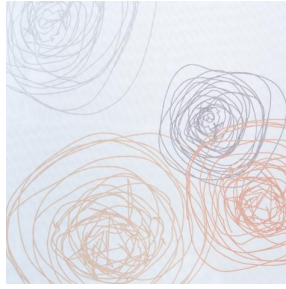
NAHIA CURRY 184