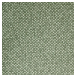
ANATOLE Cactus 36