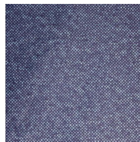
ANATOLE Océan 91