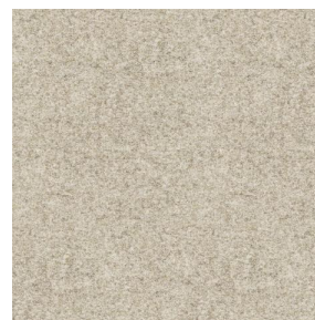
ELAINA Lin 11