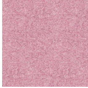
ELAINA Rose 129 Print pattern