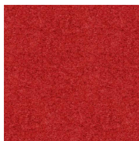
ELAINA Rouge 21