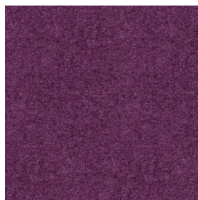
ELAINA Violine 105