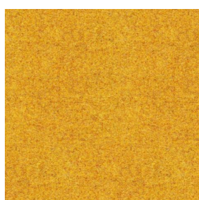
ELAINA Genêt 06