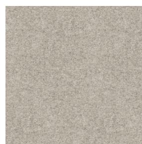
ELAINA Naturel 26