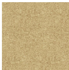
ELAINA Beige 63