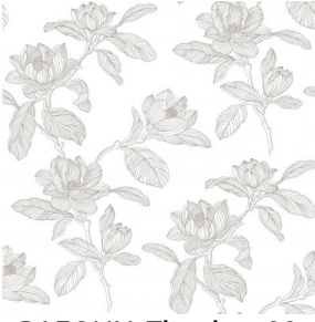
PAEONIA Titanium 98