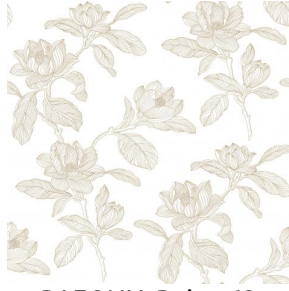
PAEONIA Beige 63