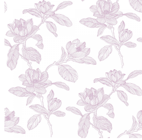
PAEONIA Hortensia 134 Print pattern