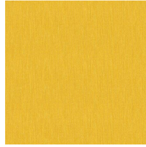
RIVE Jaune 46