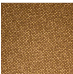
ANATOLE Or 94