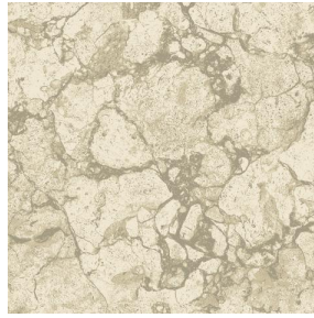
CARRARA Ficelle 09