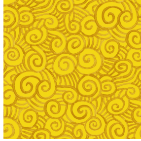
TUMULTE Maïs 37 Print pattern