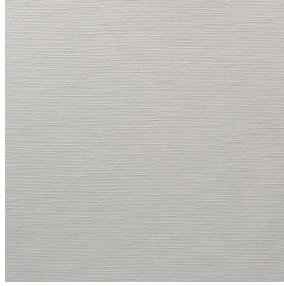
SOLLY BPI 00 Printing support