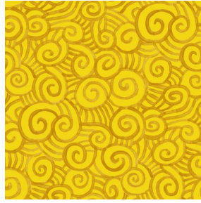
TUMULTE Maïs 37