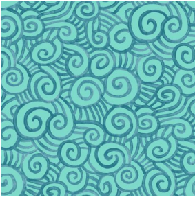
TUMULTE Menthe 122