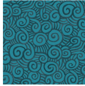
TUMULTE Orage 123