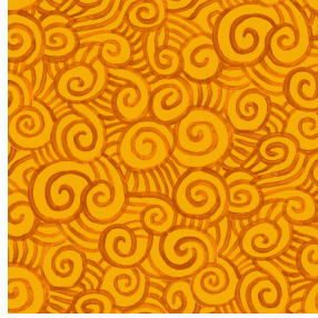
TUMULTE Safran 49 Print pattern