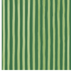
SONG Lierre 124 Print pattern