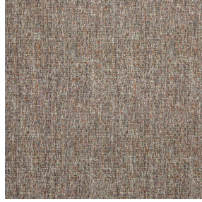
OSCAR Tomette 60 Print pattern