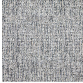
OSCAR Anthracite 38