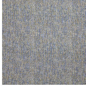
OSCAR Bleu 41 Print pattern