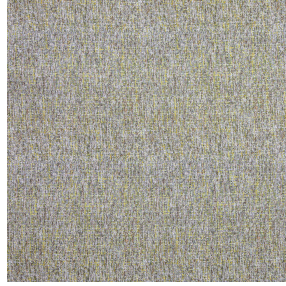
OSCAR Havane 44 Print pattern