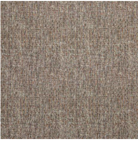
OSCAR Tomette 60