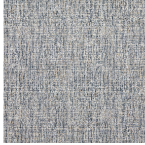
OSCAR Anthracite 38 Print pattern