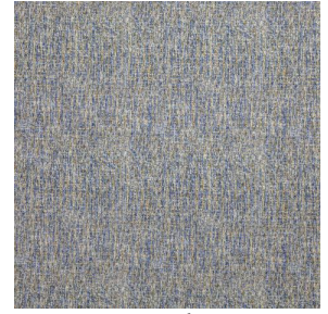
OSCAR Bleu 41