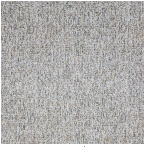
OSCAR Cordage 172