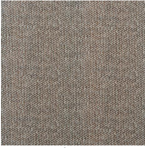
FLAKE Chataigne 55