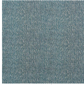
FLAKE Océan 91