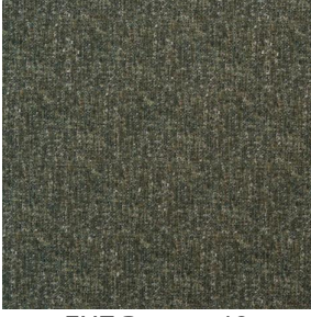
FUZ Bronze 13