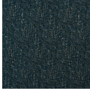
FUZ Nuit 128 Print pattern