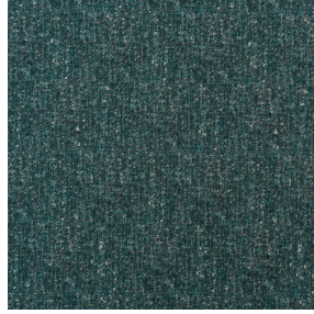
FUZ Sapin 126 Print pattern