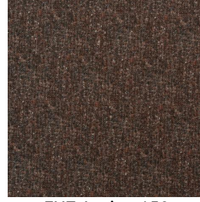
FUZ Acajou 150