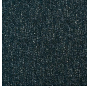
FUZ Nuit 128