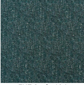
FUZ Sapin 126