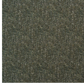
FUZ Bronze 13 Print pattern