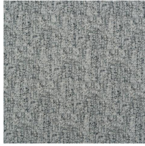
WARM Arctique 58