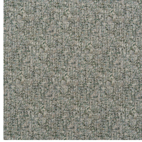
WARM Eucalyptus 117 Print pattern