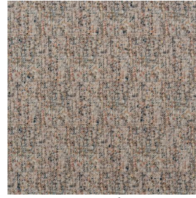
WARM Multico 98