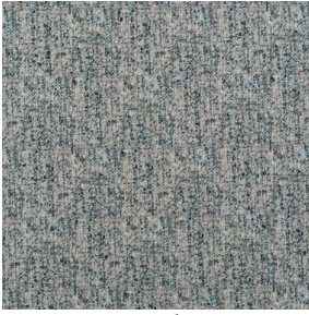
WARM Bleu 41