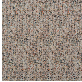
WARM Multico 98 Print pattern