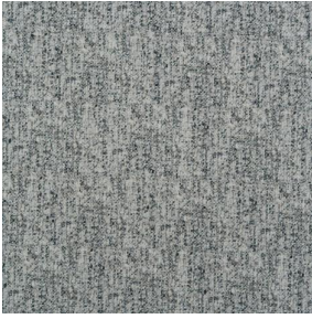
WARM Arctique 58