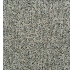
WARM Eucalyptus 117