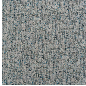
WARM Bleu 41 Print pattern