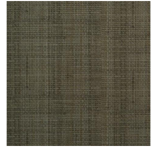
RAPHIA Kaki 148