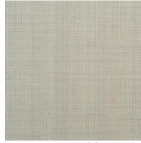
RAPHIA Sable 67