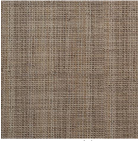
RAPHIA Sable 67