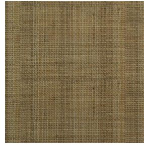
RAPHIA Chamois 111