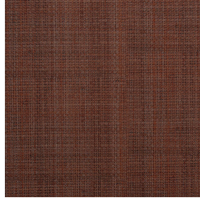
RAPHIA Poterie 167 Print pattern