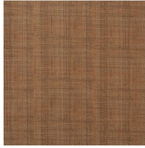
RAPHIA Osier 171