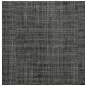
RAPHIA Fusain 71