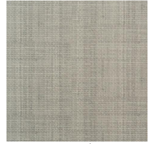
RAPHIA Galet 147