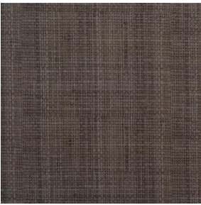
RAPHIA Taupe 95