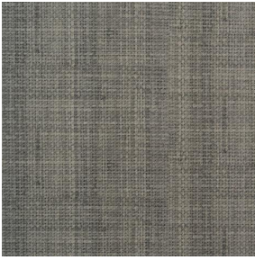
RAPHIA Gris 97