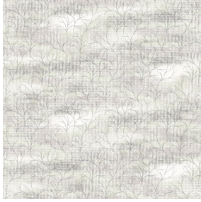
6056 Naturel 26 Print pattern