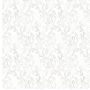
6055 Naturel 26 Print pattern