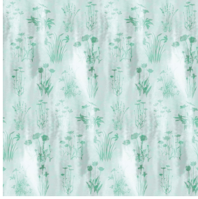
6054 Céladon 135 Print pattern