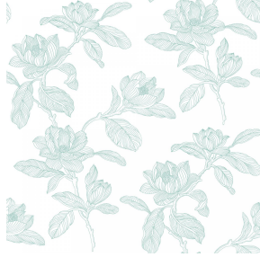
PAEONIA Turquoise 53 Print pattern