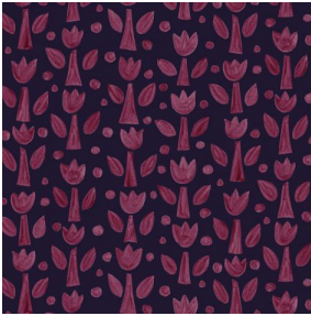
TULIPE Bordeaux 04