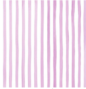
SONG Framboise 81