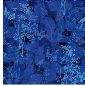
ODE Bleu 41