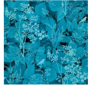
ODE Turquoise 53