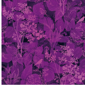
ODE Lilas 19 Print pattern