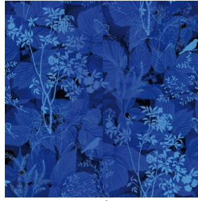
ODE Bleu 41