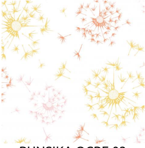
PUNSIKA OCRE 03