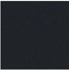
CHARLOTTE Noir 10