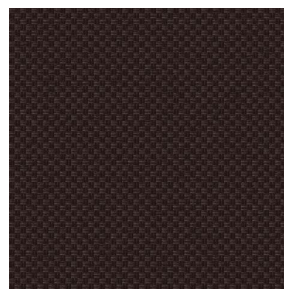
CHARLOTTE Ebene 124