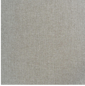
SIENTO RECYCLE UNI Lin 11 Printing support