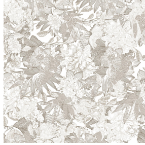
6105 Beige 63 Print pattern