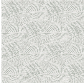
6061 Naturel 26 Print pattern