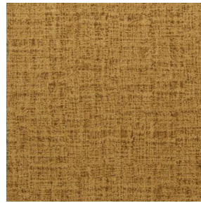
MURA SAVANE 185