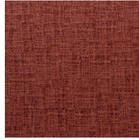
MURA GRENAT 56