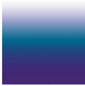
ZADIG Bleu 41