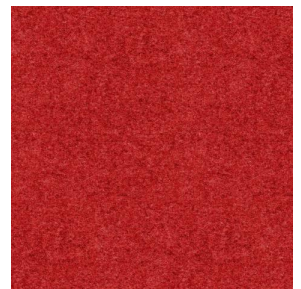
ELAINA Rouge 21