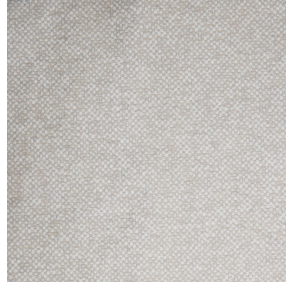
ANATOLE Naturel 26 Print pattern