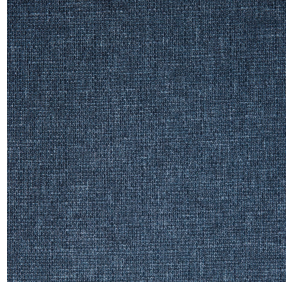
MUNA Indigo 144 Print pattern