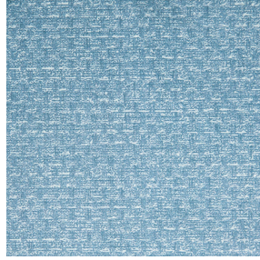
RUSTIC Glacier 43 Print pattern