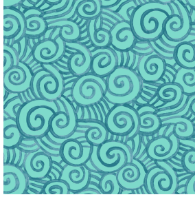
TUMULTE Menthe 122 Print pattern