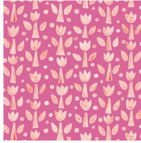
TULIPE Rose 129