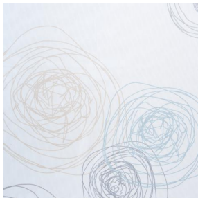
NAHIA OR 94